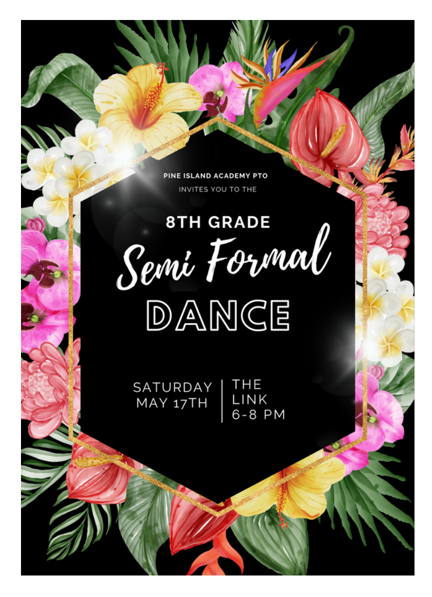
**8th Grade Families** Tickets are now available for the 8th Grade Semi Formal <a href="https://piapto.givebacks.com/store/items/1179455">https://piapto.givebacks.com/store/items/1179455</a>